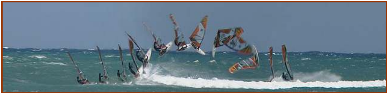
Luke busts out a forward at Coronation Beach, WA.