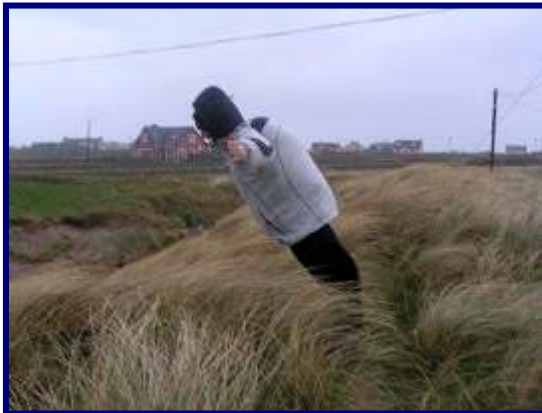
Beers at 10 am...