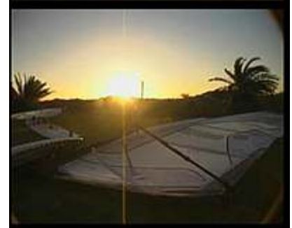
West OZ Tour Nov 05